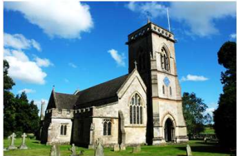
Shipton Moyne Church